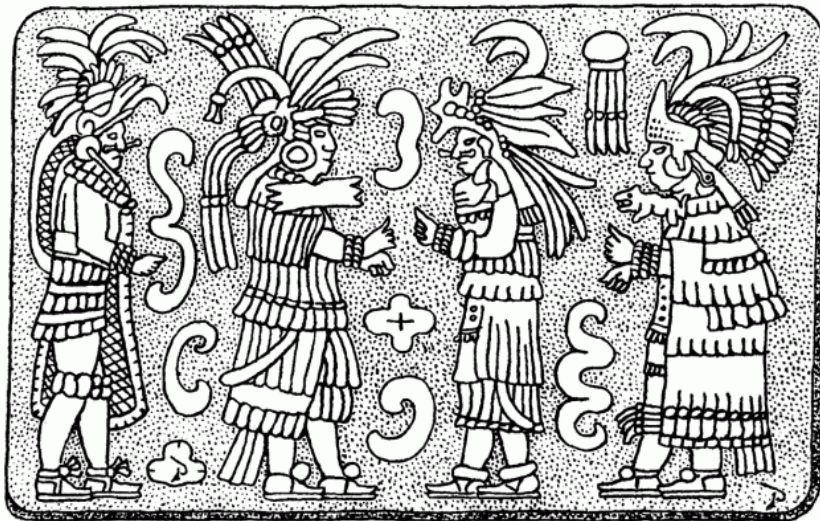
Bas relief sculpture in Chichen Itza showing captive rulers or nobles involved in a ritual ceremony.

When I saw this picture in the book “The Origin of the Advanced Maya Civilization in the Yucatan”, by Douglas T. Peck, I was truly amazed! Because this ancient picture on the wall of Chichen Itza was portraying exactly the four people, including me, who were in that sacrifice ceremony! [6]