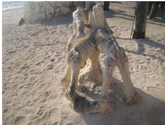
Animals with hooves from the ocean

I saw this statue on the beach on the sand in Acumal, Riviera Maya and it reminded me about this dream and this goat-deer, unusual animal with many hooves. Maybe they existed 10,000 years ago?