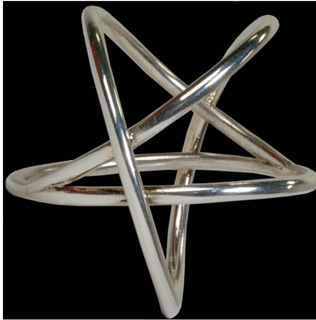
Akaija symbolises universal Love.

http://www.akaija.com/info/UK/UK05_gallery.shtml