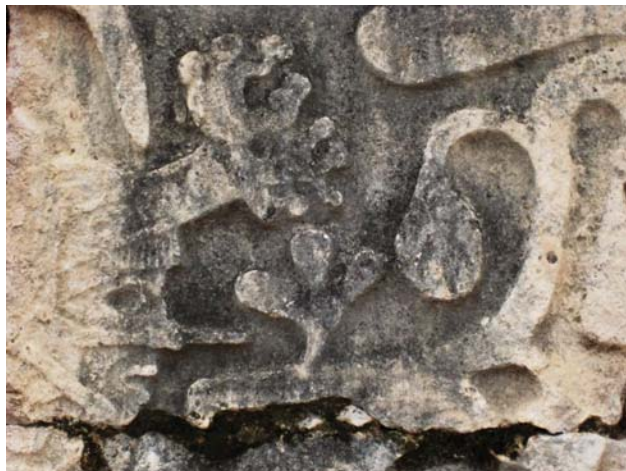
Details of the bas-relief from the wall in Ball court in Chichen Itza